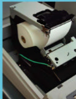
1-sheet thermal printer

Steak Set 5.00 Rice 1.50 Salad 2.50 Heineken 1.00 Hamburger 5.50 Beer 4.00 BBQ Club Sandwich 4.00 Southern Pecan Pie 23.50 Mississippi Mud Pie 21.36 CASH 2.14 TXSL 1 19:17R TAX 1 #001-000066 Uniwell