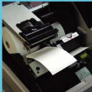
2-sheet thermal printer