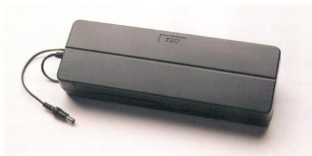
Optional Battery Pack