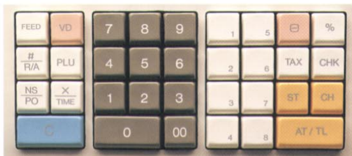
Easy to Use Keyboard