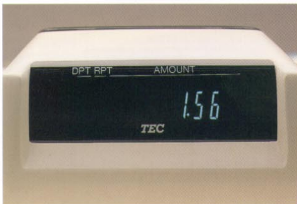
Easy to Read Customer Display